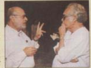
Shyam Benegal and Mrinal Sen