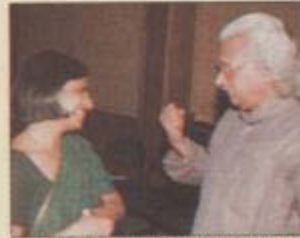
Suneeta with Adoor Gopalakrishnan